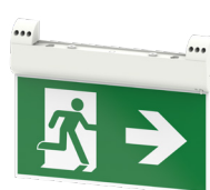
Parallel Wall Mount (2x Brackets Required)