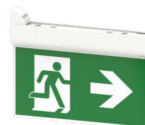
Perpendicular Wall Mount (1x Bracket Required)