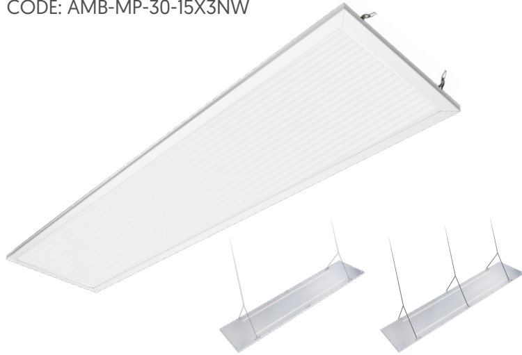
2 or 3 point adjustable suspension included (3m)